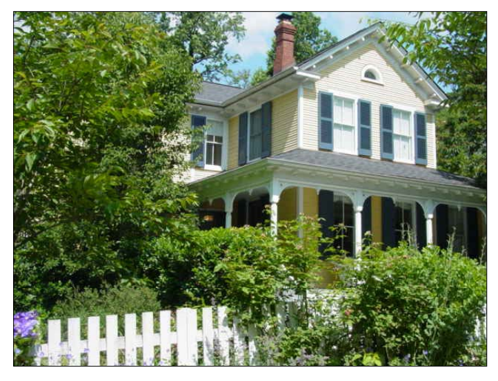
Top: This Victorian house in Somerset benefits from design standards developed as part of a traditional, local historic district. Bottom: A streetscape in the Takoma Park Historic District illustrates how setback, massing, and overall character can be maintained when historic districts are in place.

verified as "dead or dying" by a certified arborist.