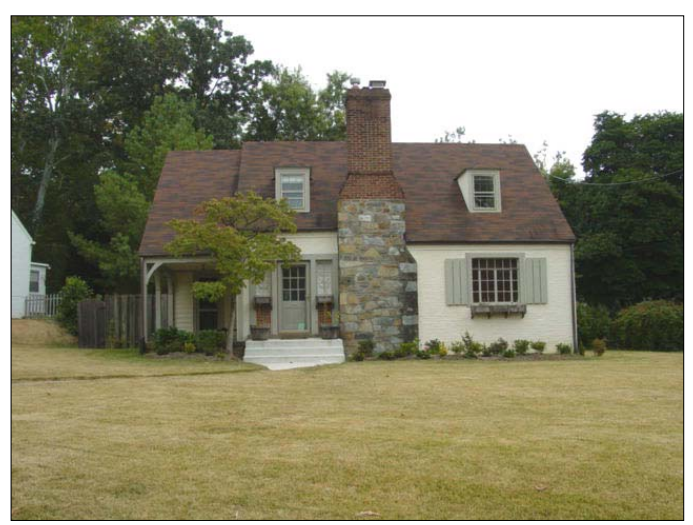
This is the type of house most threatened: a modest dwelling in a neighborhood close to downtown that lacks protection by any preservation or planning tools.

Partly because out-of-scale, infill development has been so rapid in its spread, Montgomery County has not yet developed one specific policy to address the problem head on. Instead, as this bulletin points out, the tools being used in Montgomery County have resulted primarily from grass-roots efforts by concerned citizens working with