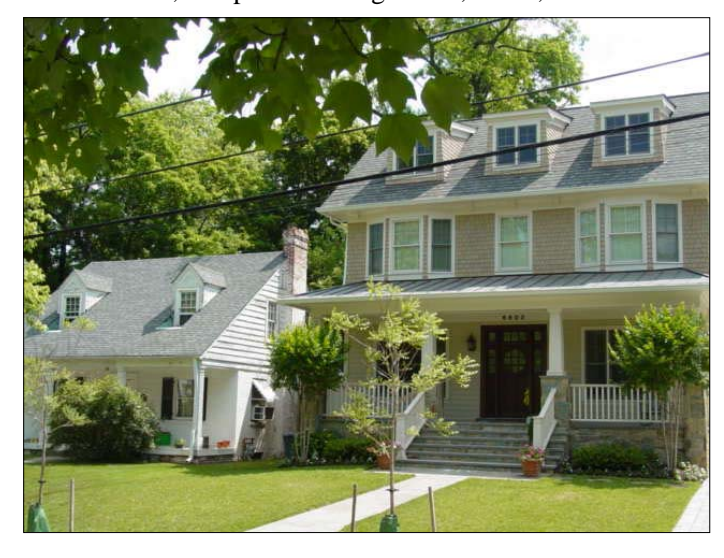
A typical scene in the Town of Chevy Chase, where an older, Cape Cod-style house on the left stands next to a newer, taller, significantly bigger house on the right. This type of new construction prompted residents to successfully petition the Town government for a demolition moratorium.

At the request of over 500 petitioners out of a town of 3000 residents, The Chevy Chase Town Council approved an emergency ordinance creating a six-month moratorium on demolitions, additions, new construction, and the removal of trees. The moratorium, adopted on August 10, 2006,