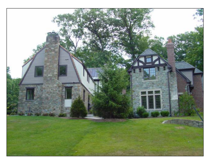
In Woodhaven, the original house on the left was turned sideways and moved to accommodate a new house to its right. The existence of two recorded lots allowed such a change. Although introducing a tighter density pattern into the neighborhood, the residents were able to convince the builder not to tear down the original house. The new house also looked to its predecessor for Tudor Revival design cues.

There are many differences to overcome before moving toward solutions. Builders emphasize that they are fulfilling a marketdriven need; namely, the desire for larger houses in close-in, established communities. Builders describe their market as comprised of people who insist on significantly more living space than can be accommodated in older neighborhood houses. For this market, very large kitchens with attached family rooms are the norm, as are extremely generous master bedroom suites and baths, and space for luxuries such as home gyms, family theaters, his and her walk-in closets, and nanny suites. Builders describe their clients as expecting tall ceiling heights (9' to 10' on average) and a dining room capacity ranging anywhere from 10 to 40 people for