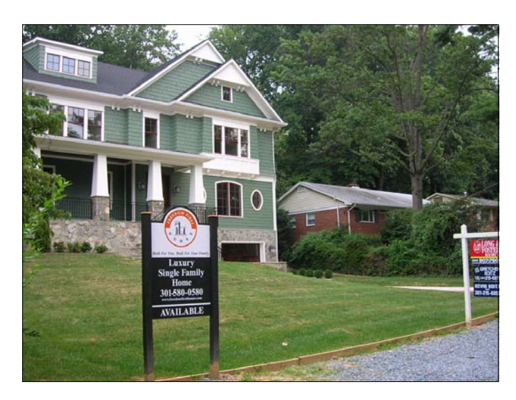
This brand new house in Glen Echo Heights dwarfs the modest ranch and Cape Cod houses of the original neighborhood, one of which can be seen amongst the mature trees behind it.

This trend is primarily being undertaken by small-scale homebuilding companies, rather than large development firms. These builders have been operating, for the most part, in accordance with existing building and zoning codes. The builders are unified