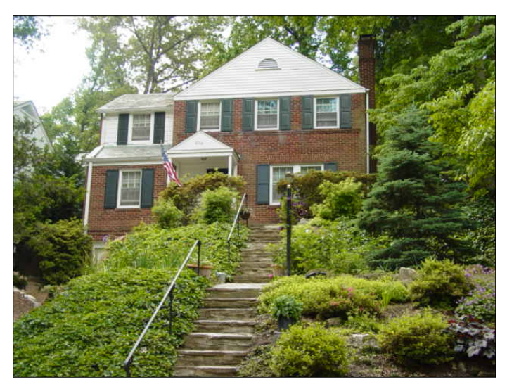
Top: A Wood Acres house from the street showing how the subdivision's character is maintained through covenants. Bottom: A different Wood Acres house, showing how covenants direct additions towards the side and rear.

Even more pertinent to the teardown phenomenon are the "guidelines" that accompany the architectural covenants. These guidelines stipulate that an owner