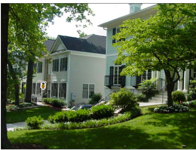
Top: An original Springfield house that was expanded, but attempted to fit in with its neighbors. Bottom: The newer trend: a series of large, new houses that replaced the older houses.

and roughly 2000 square feet of living space not counting a 150-foot screened porch), have almost all received additions of one sort or another. Most houses have seen the one-bay garage on the front of the house infilled to create a year-round room and almost all houses have received some kind of rear and/or side addition. Recently, such additions have been quite sizeable, often doubling the square footage of the houses. While the loss of back- and side-yard trees to accommodate these expansions has not been ameliorated, the character of the neighborhood as perceived from the street has been maintained. Rooflines remain the same, as does the overall scale as perceived by a passerby.