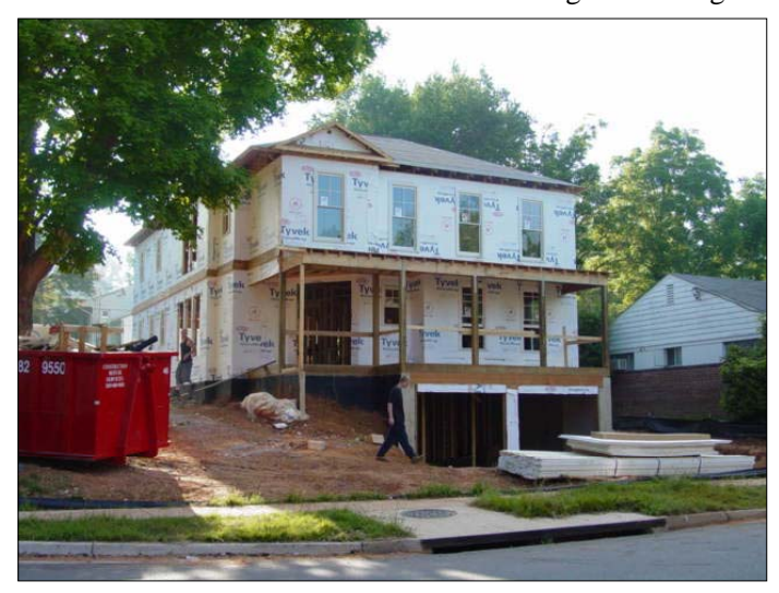
A large house under construction towers over its neighbor, but is built according to code. Such disparities in height prompted citizens to lobby the County Council for zoning revisions.

On October 18, 2005, the County Council closed a loophole in the zoning code by adopting an amendment to improve the method of calculating residential building height and reduce allowable building height on single-family houses in the R-60 and R-90 zones. (See Zoning Text Amendment 03-27.) The legislation also revised the definitions of basements and cellars, and added a definition for predevelopment and finished grades. The new zoning text amendment specified a height limit in the R-60 and R-90 zones of 35 feet as measured from the average finished grade