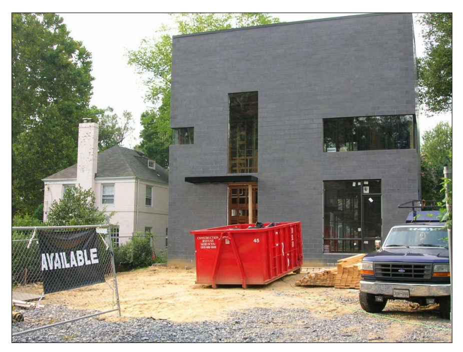
While there is nothing wrong with Modern architecture per se, the scale and massing of this new house in Edgemoor are completely at odds with those of its neighbors.

The value of NCDs as a potential planning tool came out of research for this In preparing this bulletin, concerned residents and members of the real estate/builder community were asked to provide input and ideas. Out of discussions with residents, it became apparent that many thought the neighborhood conservation district model would be a very effective tool unincorporated sections Montgomery County seeking protection of community character, but not opting for traditional historic district status. To that end, a group of residents began reviewing NCD ordinances from other parts of the country, and decided to draft enabling legislation that would allow for the creation of NCDs. This draft legislation has not yet been introduced, but may be soon.