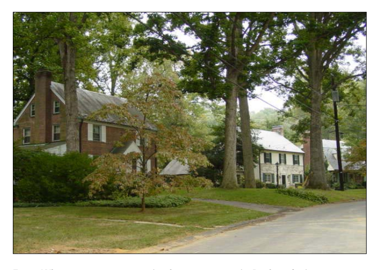
Top: What was once a typical streetscape in Bethesda is becoming a remnant, as lots are cleared of mature trees for houses of greater scale. At present, there is no obstacle to removing such trees. Bottom: A lot completely cleared of trees while being prepared for construction. In the background is a typical neighborhood house, which is far smaller than what is planned for the construction site.

In summer 2006, the Acting Director of the Montgomery County Department of