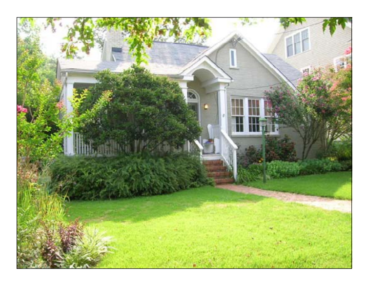
Top: An original house in this section of the Town of Chevy Chase is a small cottage-type dwelling. It is one of the only remaining original houses on the block. Bottom: The houses directly across the street are all new, giving the impression of a completely new subdivision.