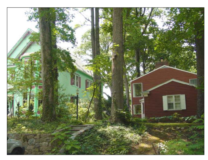
In Garrett Park, the recent, Neo-Victorian house on the left rises much higher than the smaller, older house on the right. Yet the newer house was built in conformance with the overlay zone.

The Garrett Park Overlay Zone was created as part of the North Bethesda/Garrett Park Master Plan, which went into effect in 1993. The overlay zone seeks to "preserve the unique park-like setting of the 19th century garden suburb, maintain the prevailing pattern of houses and open spaces, and retain the maximum amount of green area surrounding new or expanded houses." The overlay standards increase the amount of front, rear, and side setbacks from the street and adjacent properties; limit the maximum percentage of net lot area that may be covered to 20%; and limit the maximum floor area ratio (FAR) to .375. All of these standards are more stringent than those for a typical R-90 zone.