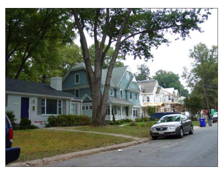
Above: This street in English Village has been in a constant state of construction for years. Almost all of the original houses have been replaced. Below: This new house in Bethesda indicates the trend for double facade garages and paved driveways, regardless of established neighborhood patterns.

In addition to discretionary review items, many neighborhoods opt for development controls that are non-discretionary or ministerial in their planning. These controls also come out of