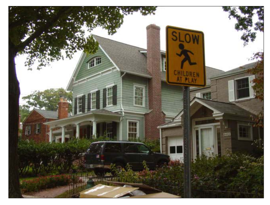
This new house in the Sonoma area of Bethesda rises significantly higher than its neighbors.

Several lower Montgomery County municipalities turned to the state legislature to gain control over mansionization within their borders. On May 26, 2006, state legislation was adopted that will give municipalities the right to adopt stricter controls on the dimensions of structures, including height, bulk, massing and design, and on lot coverage, including impervious surfaces. This authority, granted through the enactment of House Bill 1232, becomes effective on October 1, 2006. In addition, some unincorporated sections of the county are considering incorporation as a means of accessing these new planning tools.